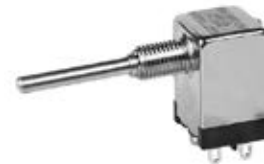
Changes for MRT Rotaries

2. MRT Rotaries will have a change on the switch case that will include both standard and custom devices. The updated logo will replace the factory name “NIKKAI”. The table illustrates the difference.