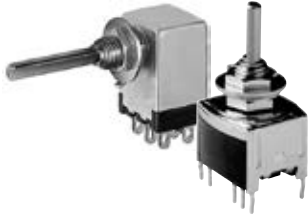
Changes for MRT & MRB Rotaries