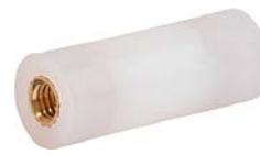
Transpillars Style 3