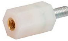
Transpillars Style 2